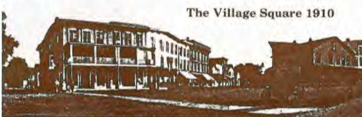
The Village Square 1910