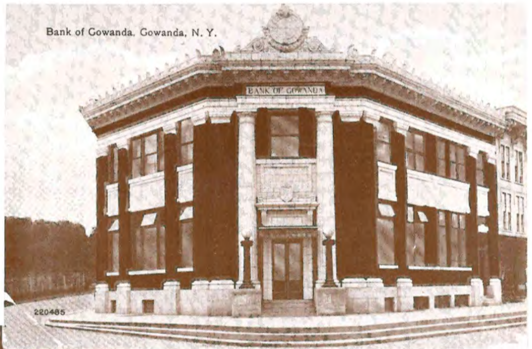
Bank of Gowanda, Gowanda, N. Y.